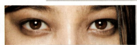
D. Sheer charcoal wash at Alexander Wang