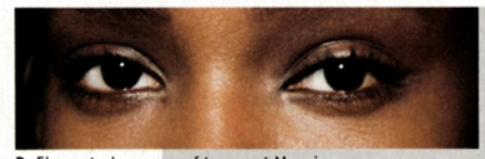
B. Elongated sweeps of taupe at Marni