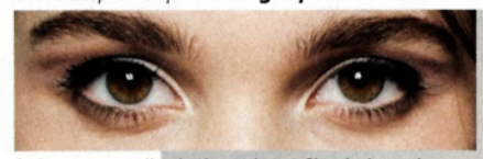
A. A warm-grey line in the socket at Giorgio Armani

Cos opens its first Canadian outpost this month at 85 Bloor St. W. If you've shopped H&M's sophista sister brand in New York, London or Paris, you'll understand our nearly cross-eyed excitement. The line's minimalist pieces look (and feel) designer, but the accessible price point—around $250 for a dress—means that you can go shopping, and, you know, pay rent.