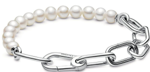
Pandora ME bracelet, $225, pandora.ca.